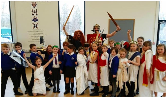
Immersive learning for Year 4 today as part of Roman Day