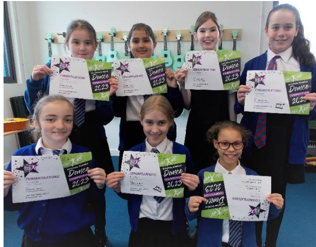
Our fantastic dance troupe with their certificates

On Friday 26 th May - the last day of next term - we are excited to announce that we will be holding a 'Bishop Chavasse's Got Talent' competition. Watch this space for details!