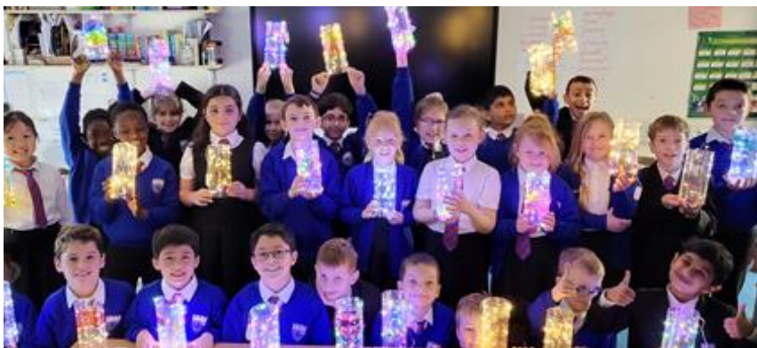
4A: a class full of night lights

As Term 4 draws to a close, it leaves me just to wish you all a very Happy Easter. On behalf of all the staff, I wish you a much deserved, peaceful break wherever you may be spending it. We look forward to welcoming all the children back to school on Monday 17 th April at 8.45am, dressed smartly in the correct uniform with water bottles, reading books and PE kits ready for an exciting, hopefully warmer, term packed with rich learning opportunities.