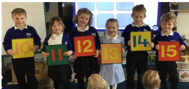
Early Years learning all about the numbers 10-15 this week

The key to a successful learning journey at Primary school is a solid, trusting relationship built between home and school. We believe children learn best when home and school work closely together. We welcome parents to school to share their children's learning, to meet the teachers, for workshops to share how we teach your child and for conversations and communications that will benefit your child's time at school. Already this week we have had two workshops for parents to support their understanding of the curriculum for children in year 2 and year 1. Next week, parents of Year 3 and year 4 children are invited in to learn about the multiplication check their children will take, and Year 5 parents will soon receive an invitation to learn more about the transition to Secondary School. If there are any areas of the curriculum you would like to know more about, please do let us know.