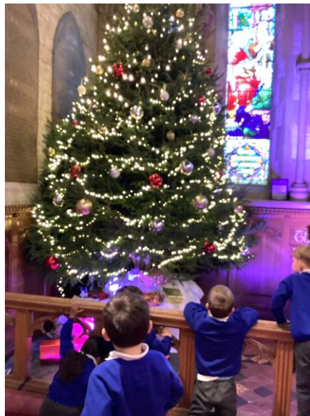
Years 1 and 2 Headteacher Heroes in front of our school Christmas Tree (thank you PTA!) and Early Years marvelling at the tree during their trip to St Stephen's church