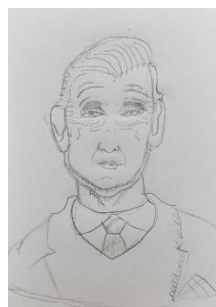
Year 5 portraits of King Charles III