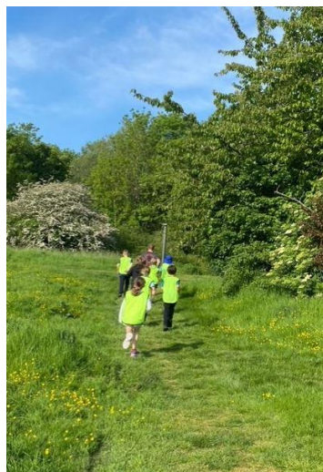
Running Club enjoying the sunshine – and running 3.5km on Thursday before school!

As the sun shines for our final day before the half term break, the staff team here wish you all a very restful half term holiday.