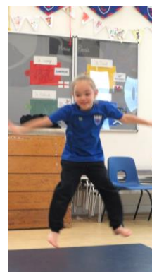
Year 1 is enjoying gymnastics with a professional coach this term