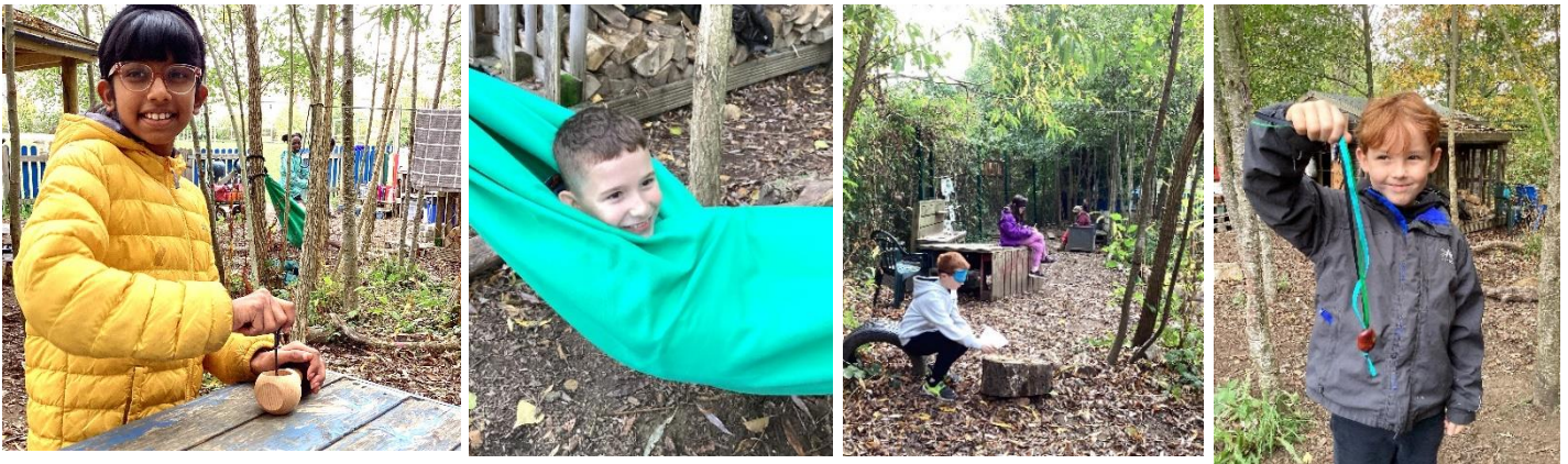
Year 5 and Year 4 in Forest School this week