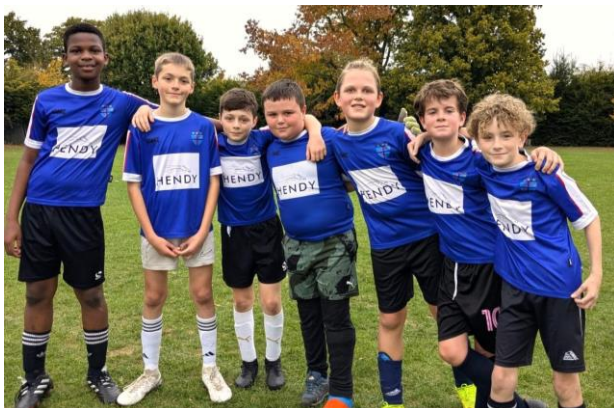
Our Year 6 football team played Woodlands Primary School last Friday: turn to page 3 for the result!

As we close our gates this afternoon, on behalf of my team and myself, I thank everyone for your ongoing unwavering support for our school and wish you all a half term filled with wow and now moments; a different pace of time together. We look forward to welcoming everyone back to school on Monday 27 th October in winter uniform.