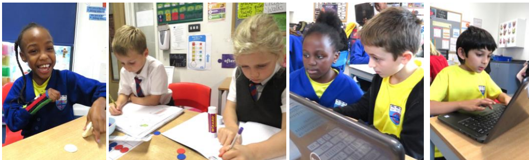
Classroom learning around school this week

And so, we draw Term 1 of academic year 2025-2026 to a close. It is hard to believe it is already half term in many ways, but when I took the opportunity to look at pupils' books and dip in and out of classrooms this week, it is clear that we've had seven weeks of high quality, rich learning in our classrooms and the children have made some amazing progress. It was a heart-warming experience to witness the broad smiles and laughter throughout the hall this week at parent consultations - the perfect opportunity for us to share your children's strengths, wow moments and progress and perhaps offer some advice about how to nurture those areas that might be a little more challenging for some. The sense of pride that radiated from our parent community was palpable and I know my team felt this too. As tables were packed away so many teachers excitedly acknowledged just how pertinent these 10 minutes are to focus on the teaching and learning going on for each child and their own individual learning journeys. I may sound like a broken record, but by establishing positive communication with parents and carers, open trusting relationships form easily and through this we successfully work together to ensure the children, the individual, unique lights that brighten our day, flourish and thrive in the most radiant of ways.