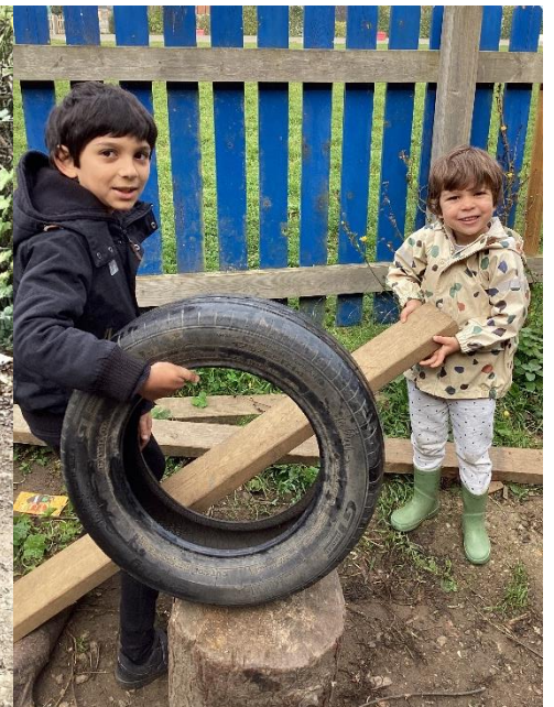
Forest School this week