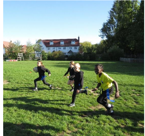
Year 5 are enjoying rugby coaching with Tonbridge Juddians on Monday mornings this term