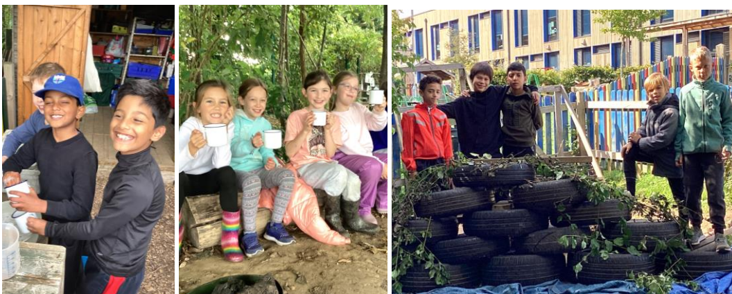
Smiles, hot chocolate and tyre constructions in Forest School this week!

Giving the children opportunities to engage with different trusted adults is an important part of the work we do in enabling children to recognise they are part of our community but also part of a wider community-an important understanding to have and often a key contributor to the children developing their hopes and dreams for their own futures, beyond the walls of Bishop Chavasse.