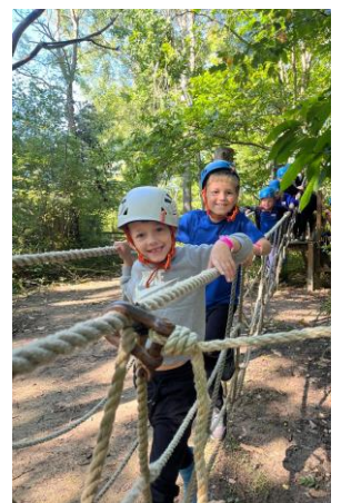
Team building at Carroty Wood today – see page 2