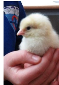
Skylar (6S): Jade