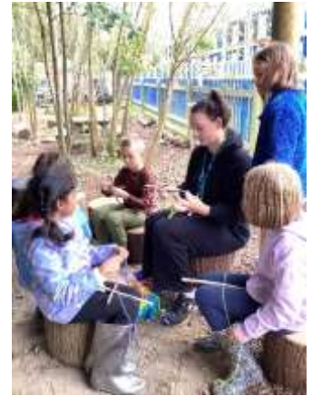
Year 3 Forest School this week

As more pupils have their own smart phones, we are also aware that more children are wearing smart watches to school. In line with our acceptable usage policy , if your child wears a smart watch to school, it will need to be handed in along with their phone at the start of the day and collected at the end, to ensure our pupils are safe at school.