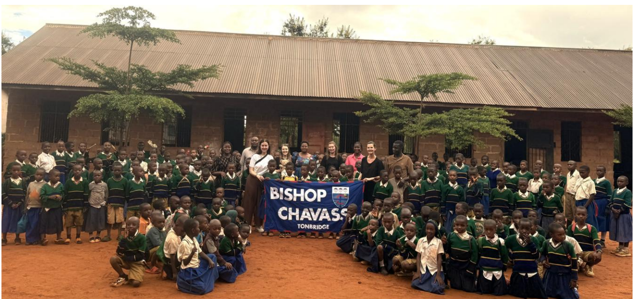
An incredible visit to our partner school Matongoro in Tanzania over the Easter holidays – see page 2 for more

For our other year groups, the Summer term brings a time to consolidate their learning, cement friendships and be open to the blossoming of new ones, grow in confidence and curiosity, strengthen one's own sense of self and spirituality and enjoy the learning journey they are on. All staff are looking forward to a term where we always see a huge amount of growth in our young beacons of light, one where the children themselves recognise their growth and how to celebrate their successes. The Summer term is a joyous one, it is busy, but a very special term for so many. With your unwavering support, open communication, patience, compassion and understanding, the positive relationships we have as a community will bloom vividly across our school.