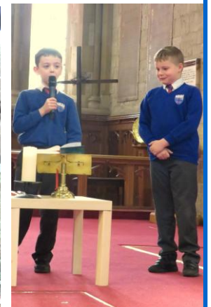
This last week has seen two highlights of term: the Easter service led by Year 3 and the KS2 Spring Concert – more on pages 2 and 3