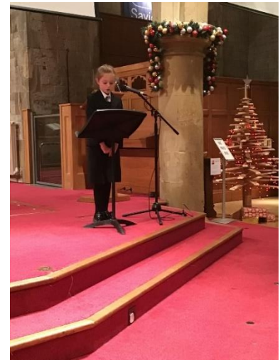
Our final Christmas collective worship was held at school due to the icy conditions. It