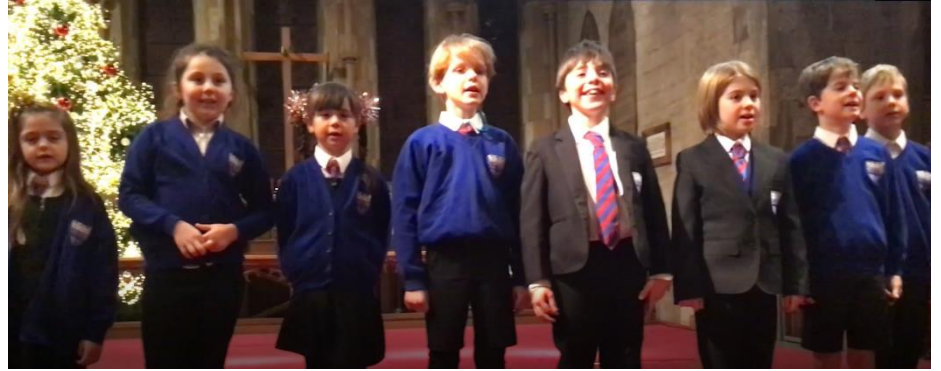
The KS2 Carol Concert on Monday was a magical evening: the children sang their hearts out, the recorders tooted Jingle Bells and we even had a rendition of We Wish You A Merry Christmas on the ukelele.