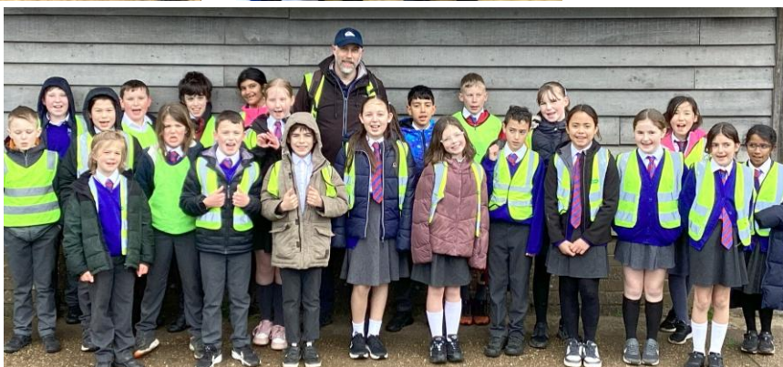
A busy week for workshops and trips: see pages 2-3 for all the action!