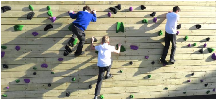
Our new PTA-funded climbing walls are proving a huge hit with the children – see page 2