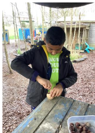
Happy to be back in a mud-free Forest School this week, with some first signs of Spring!