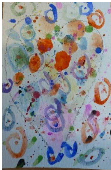
Year 4 child and Year 1 child's interpretation of Kandinsky