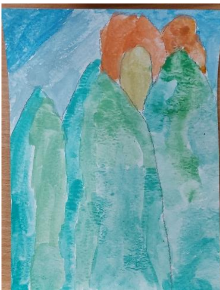
Year 1 child interpretation of Georgia O'Keefe

“I really enjoy coming to watercolour and want to do it again” - a year 1 child.