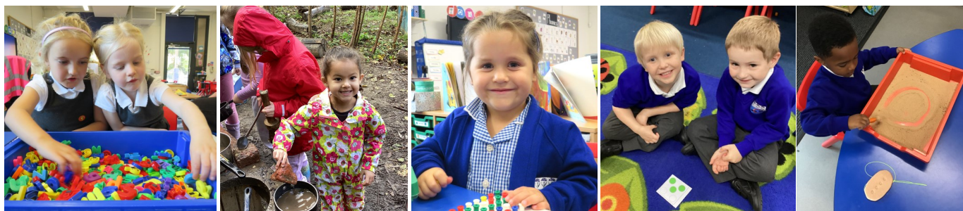
EYFS (Early Years Foundation Stage)