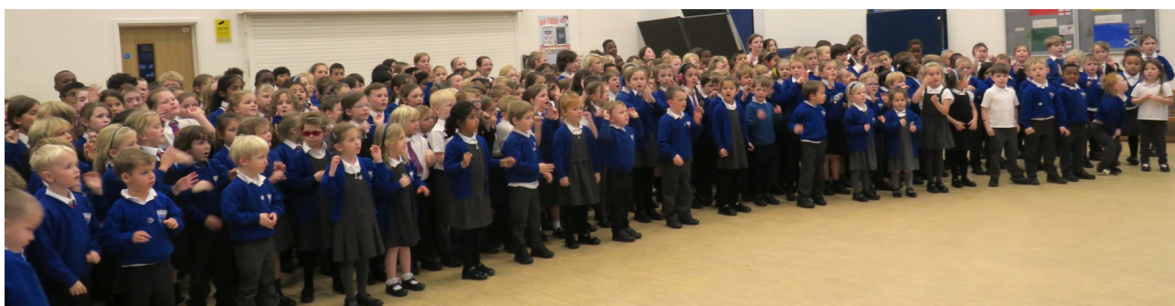
Our whole school taking part in Collective Worship

We are delighted you have chosen to be part of our school community – we are a large school but have a distinctly warm and welcoming family feel which will ensure you and your child will settle in quickly and make new friends.