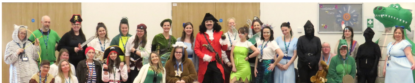
Our staff teaching team, World Book Day 2025

We are delighted you have chosen to be part of our school community – we are a large school but have a distinctly warm and welcoming family feel which will ensure you and your child will settle in quickly and make new friends.