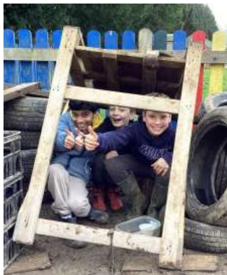
A fabulous start to the new term in Forest School