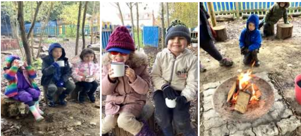
Definitely a week for hot chocolate and marshmallows around the camp fire in Forest School!

Yet rooted in all this is the most beautiful awe inspiring experience; that of watching a community of children grow, be inspired and motivated to fulfil their own unique and extraordinary potential and achieve excellence, become curious and confident and they overcome challenges and hurdles that prepare them for their lives beyond Bishop Chavasse... and there is no member of staff who would swap their busy day to miss that.